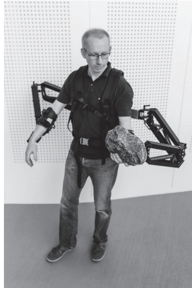
Figure 3: Prototype of Robo-Mate arm module